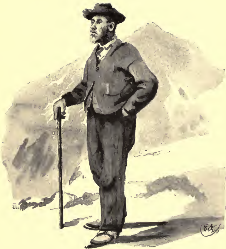
The Snowdon guide outside the parlour window.